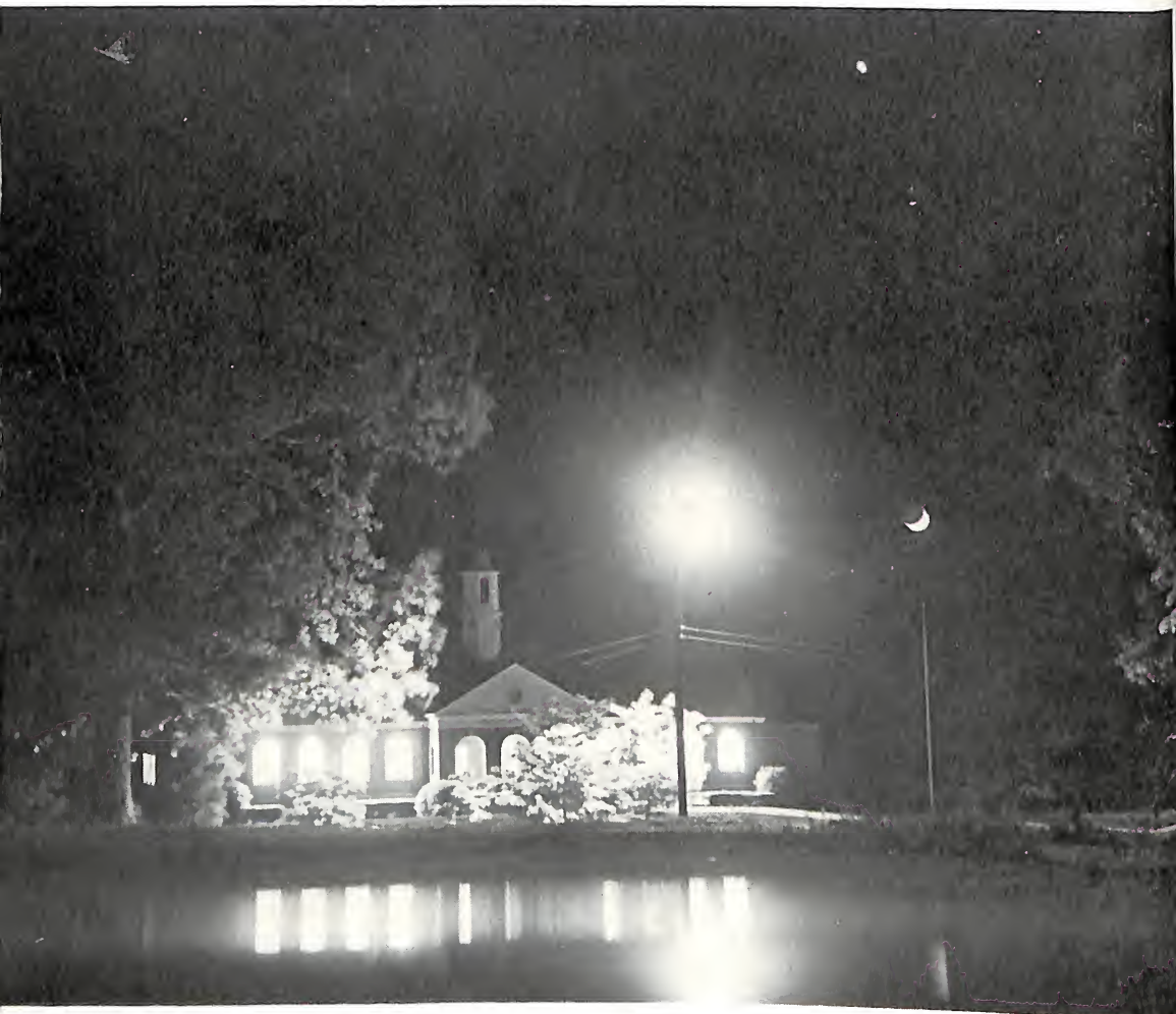
Lights In The Darkness — Keep Them Burning